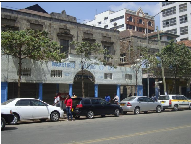
Imperial Chambers Building on Government Road