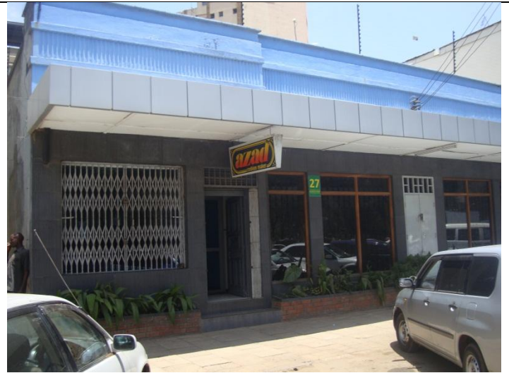
The Renowned Azad Cushion Makers. .Malik Street