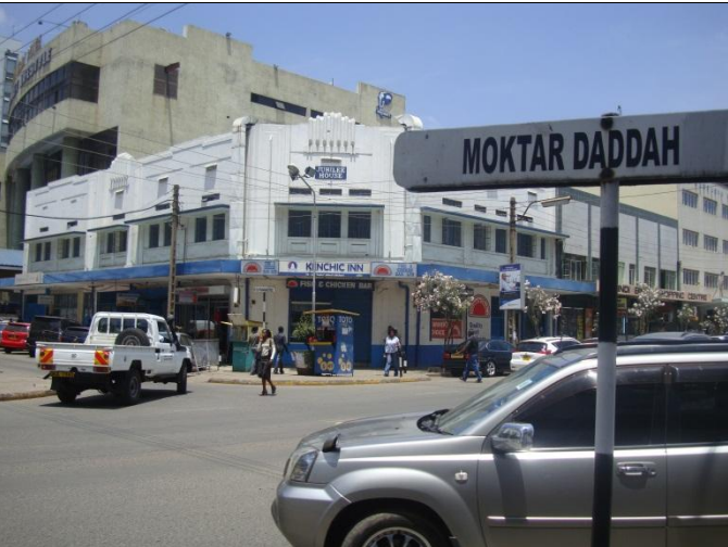
Jubilee House, Stewart Street – the original fish and chips eating place but certainly lacking in charisma of the past. Not to be mistaken with Jubilee Insurance Office Building.