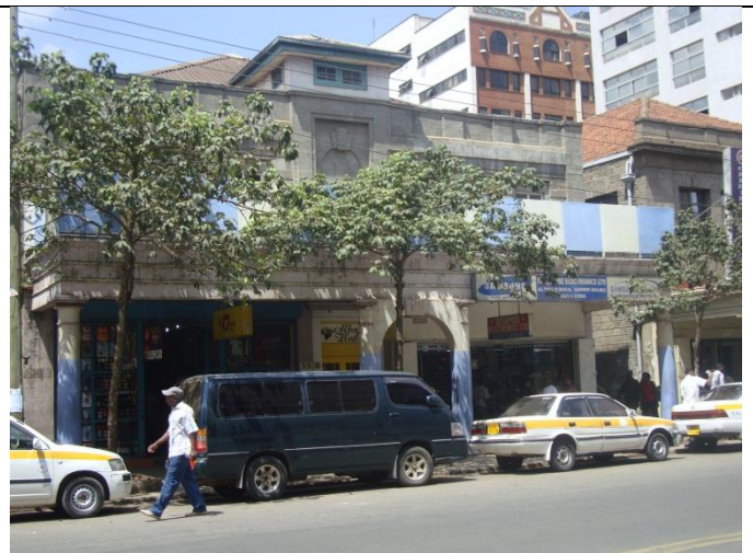
Mboya House, Government Road. (Presumably Building was renamed after Independence)