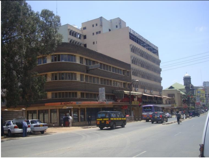
The Building where auctions used to be held. Government Road . Khoja Khana in the background