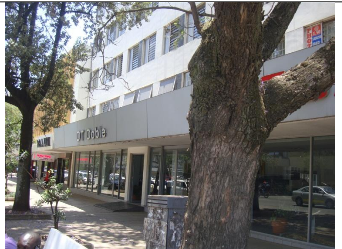
The well known Mercedes Dealer D T Dobie. Sadler Street.