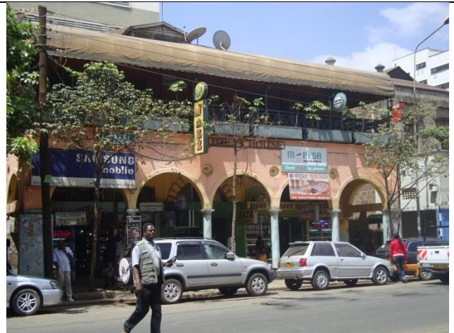
Royalty House Government Road