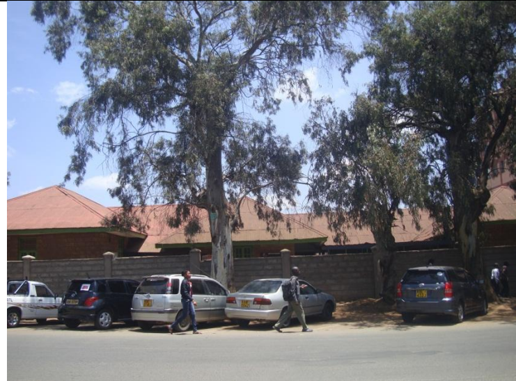
Primary School next to the Auction House. Government Road.