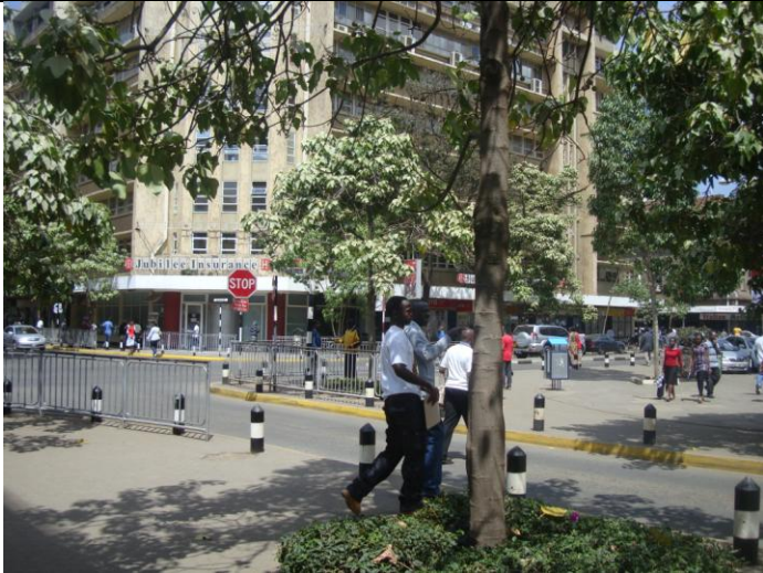
Mansion House – corner of Queens Way and Elliot Street