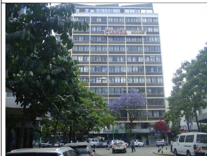
Cianda House – Formerly Caltex House. Stewart Street.