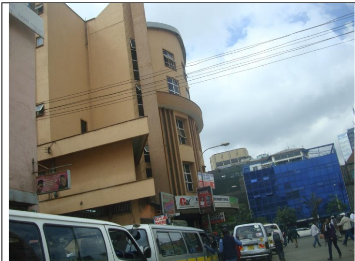
The old Odeon Cinema now changed significantly