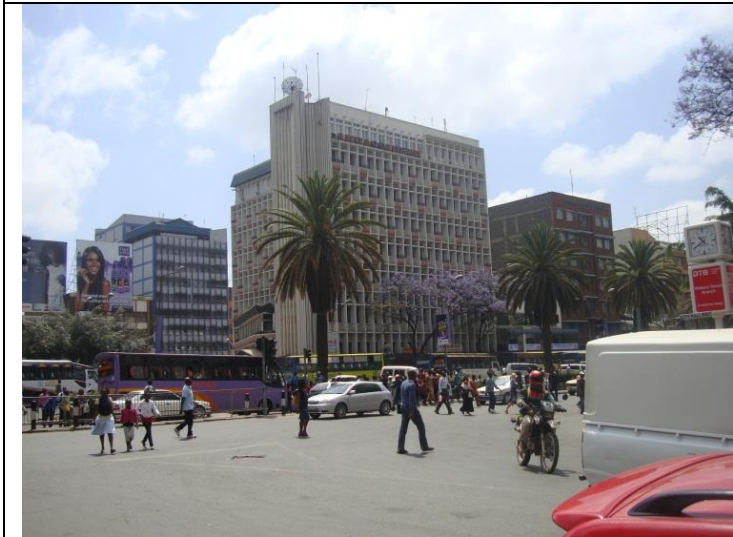
Ambasadeur Hotel, Government Road