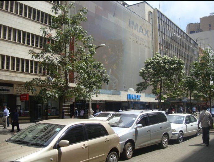
The sad case of 20 th Century now. Hideously masked and unrecognizable