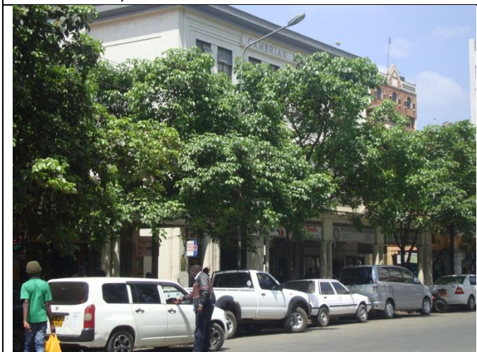
Cambrian Building, Government Road