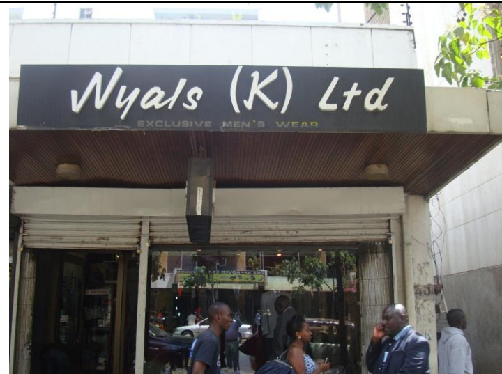
Nyals the well known Menswear Outfitters, Government Road. Still run by same family.