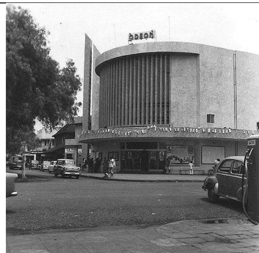
Odeon Cinema, Victoria Street - Then