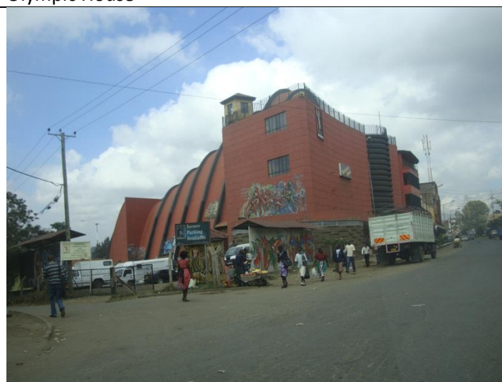
Shan Cinema Ngara