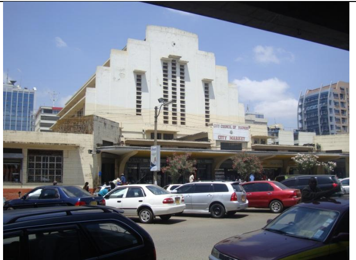
The Market in Stewart Street still there. The fish we bought was delicious.