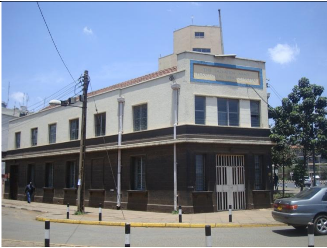
Salvation Army Building adjacent to Jeevanji Gardens. Corner of Government Road and Malik Street.