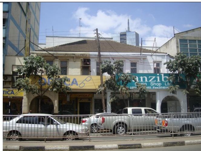
Unknown Building name, Government Road