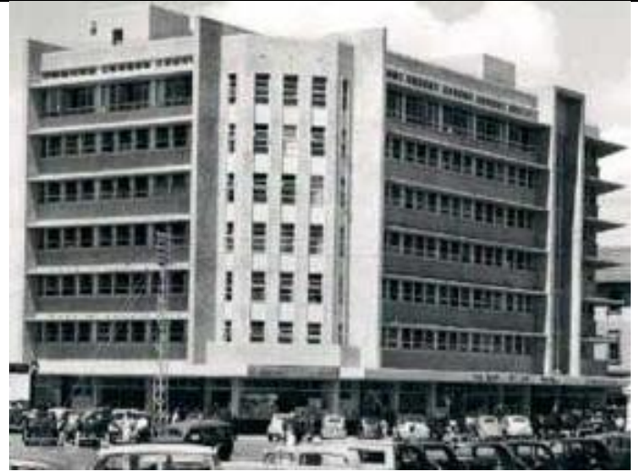
Mansion House in 1952