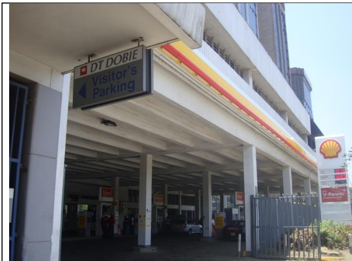
The old Vic Preston Petrol Station and garage next to D T Dobie. Kings Way.