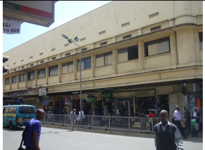
Full side view of Regal Mansion as viewed from Government Road.