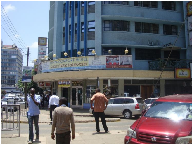
Mombasa House. Sadler Street.