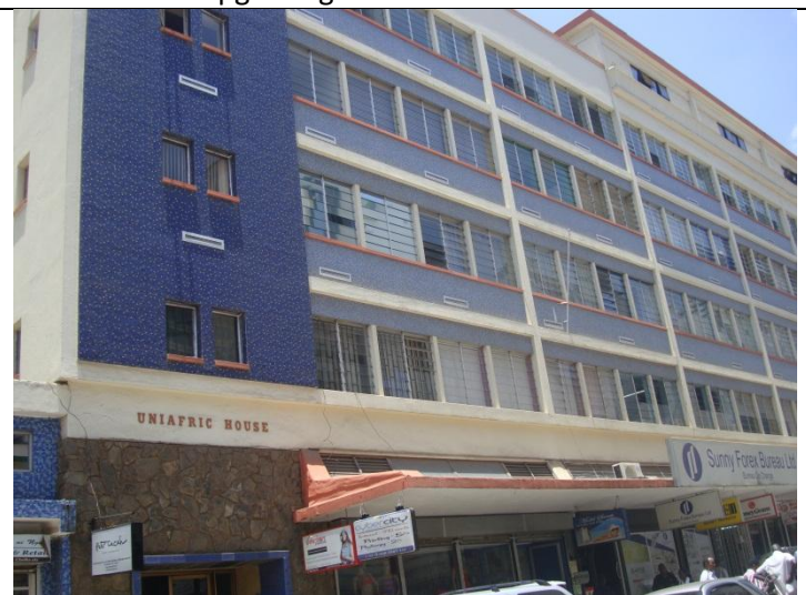
Panafric House – An late 1950's development