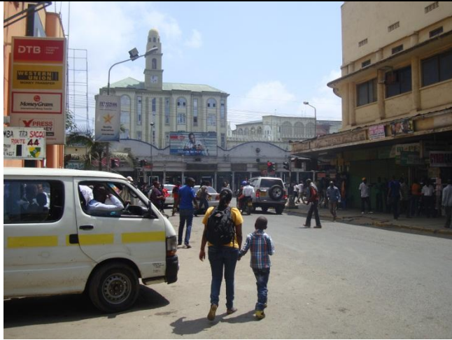
Regal Mansion on the right. Lobster Pot was situated just there. Photo taken standing from Government Road. The background building with a blue wavy roofline is situated on Victoria Street.

Note: Road Names referred to the old Nairobi Map of the 1950's