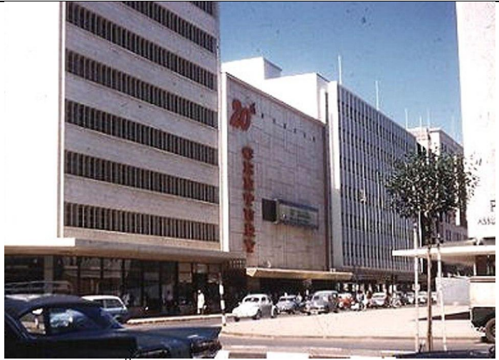
This is how 20 th Century Cinema looked 50 years ago. Queens Way.