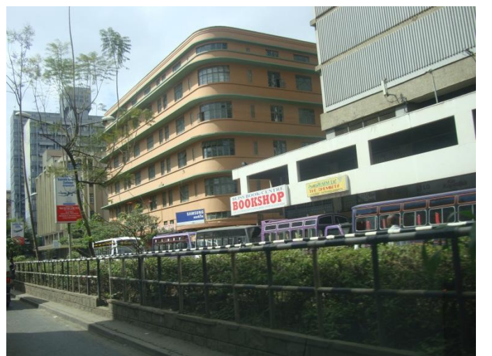
Gill House has hardly changed. Viewed from Victoria Street