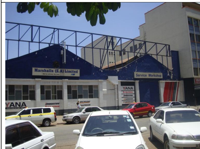
Marshalls Motor Workshops – the old colonial still remains intact, but for how long?