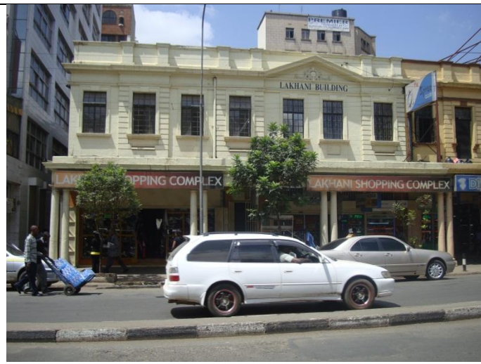
Lakhani Building, Government Road