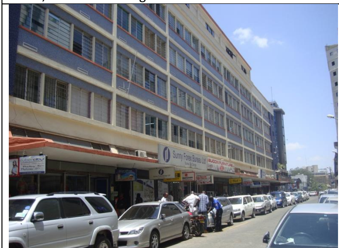
Panafric House – full view