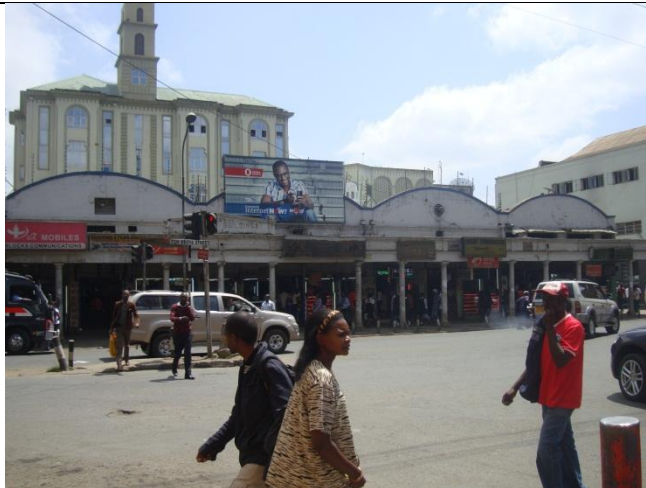
Close up of the wavy roofline building on Victoria Street. Odeon Cinema would be a bit further on the right