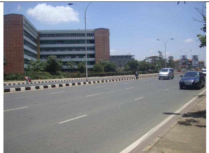
Kings Way. The changing face of Nairobi's road network – but the city traffic problem remains chronic and still in need of substantial upgrading.